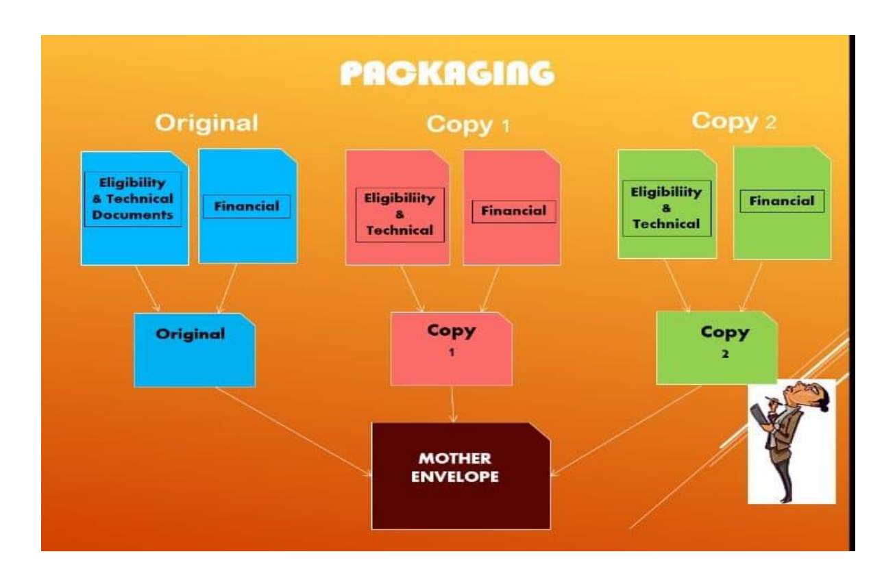
REMINDER: Please refer the Checklist provided in the Bidding Documents on what should be included in Eligibility and Technical Documents (Envelope No. 1) and Financial Component (Envelope No. 2). Bid documents should be submitted in three copies as illustrated above and arrange in the order as listed in the checklist with proper markings/tabs. All bid documents should be secured by a binder (ex. paper fastener)